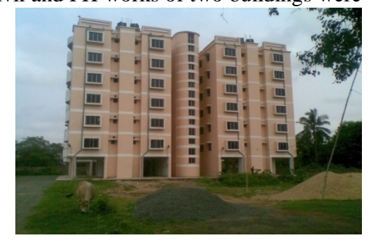
Multi-storied Residential Building for doctors, SCBMCH, Cuttack

completed. Finishing work of remaining four buildings could not be taken up for want of electrical installations. Hence, buildings could be handed over to not user department. Expenditure incurred on these buildings was ₹ 9.51crore. No tender invited (July/August was 2013) for electrical installation works.