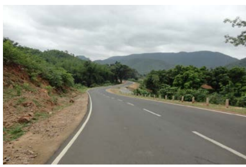
Completed stretch of South North Corridor

towards overhead per cent charges and contractor's profit. The remaining projects 10 financially and technically approved by MoRT&H based on estimated cost arrived at by the CE. In seven<sup>54</sup> of them (estimates of three projects were not made available to audit) the CE adopted 8 per cent towards overhead charges and another 10 per cent thereon for contractor's profit working out to 18.8 per cent